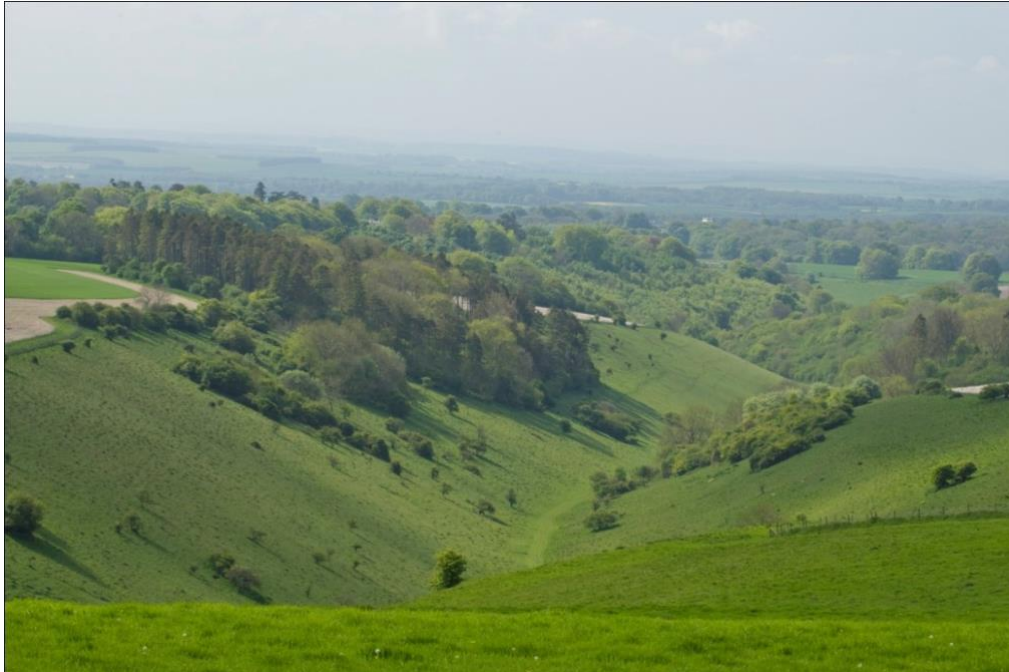
Cranborne Chase Area Of Outstanding Natural Beauty

In partnership with Chase and Chalke Landscape Partnership Scheme we have now started our workshops in the beautiful Cranborne Chase Area of Outstanding Natural Beauty.