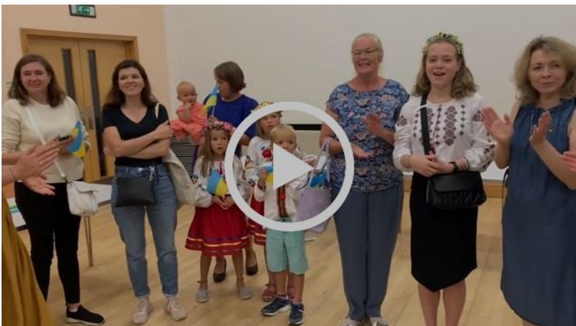
Celebrating Ukraine's Independence Day

Our first challenge was to seek out different groups to take part in the project. In August we experienced a wonderful evening celebrating Ukraine's Independence Day, inviting our Ukrainian guests and their hosts to join our project.