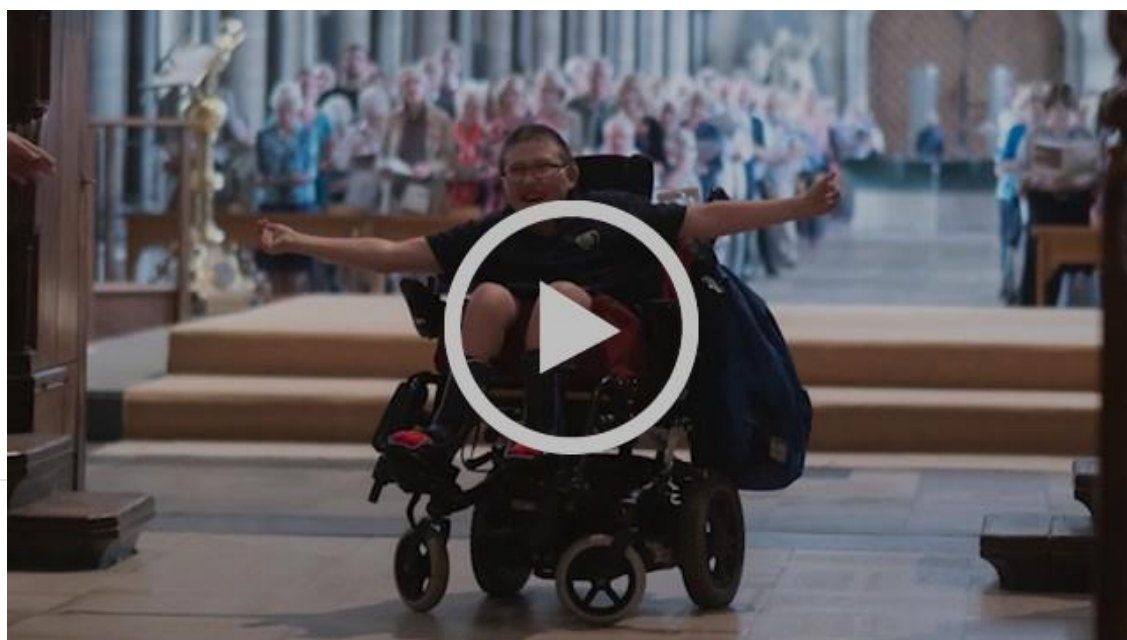
Introduction to La Folia

Please watch our new introductory film below.