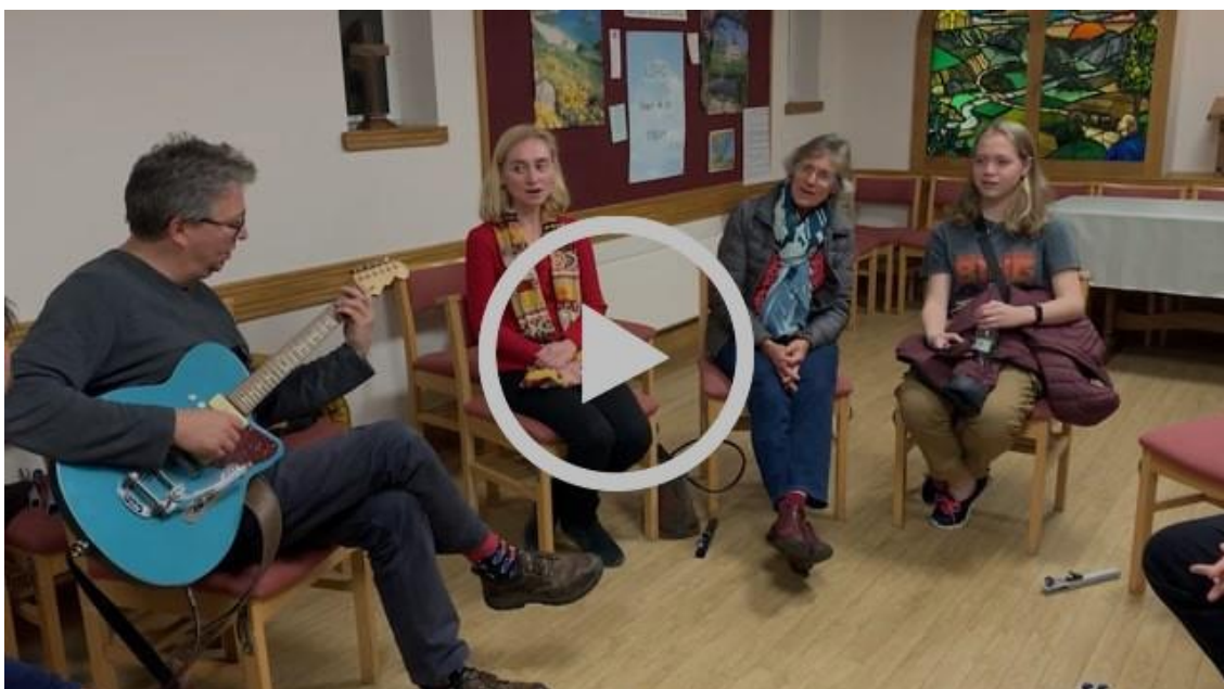
Ukrainian workshop 'The Water is Wide'

We have more workshops planned for 2023 and we will be going out into the countryside again to collect folksongs from the locals. By the end of the project our groups will have created their own folksongs which will be published in an online book, along with existing folksongs from the area.